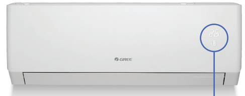
Crossover wall-mounted unit