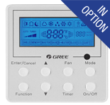
Wired controller (XE-71)