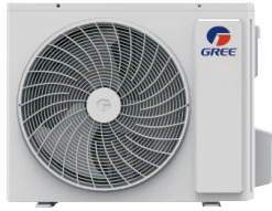
Crossover condensing unit